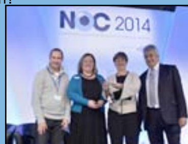
2014 NOC Poster winners Devon LOC with their award posters

This year we are looking for posters that tell the story of your LOC, LOC Company or LEHN achievements. We are not looking for academic posters.